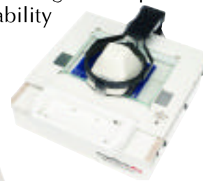
Computer system sold separately.

The ImageMouse Plus® carriage gives you cost-effective microfiche scanning with superior stability